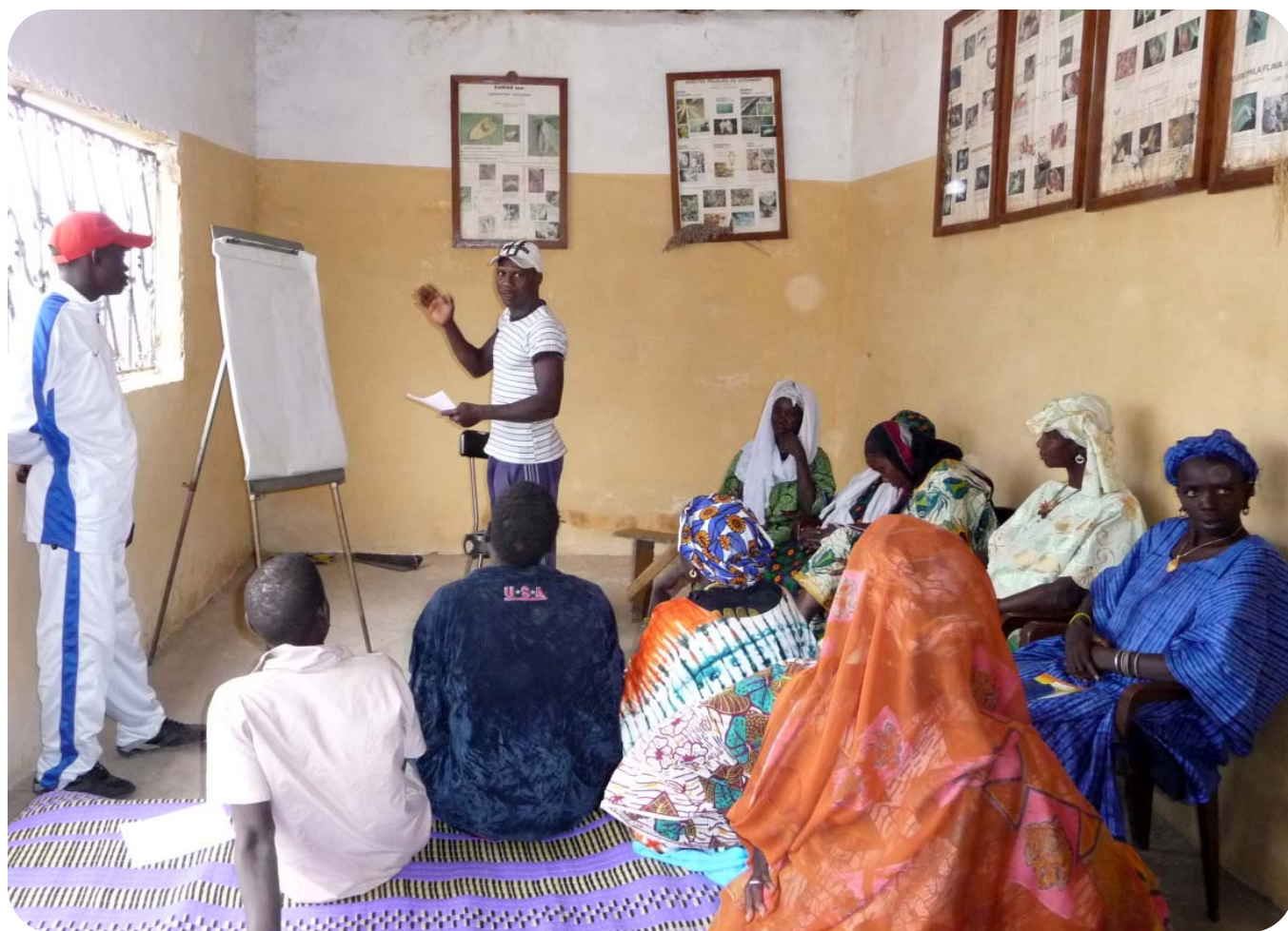
YNW members in a training session on managing millet grinding mills at the Federation's new HQ.