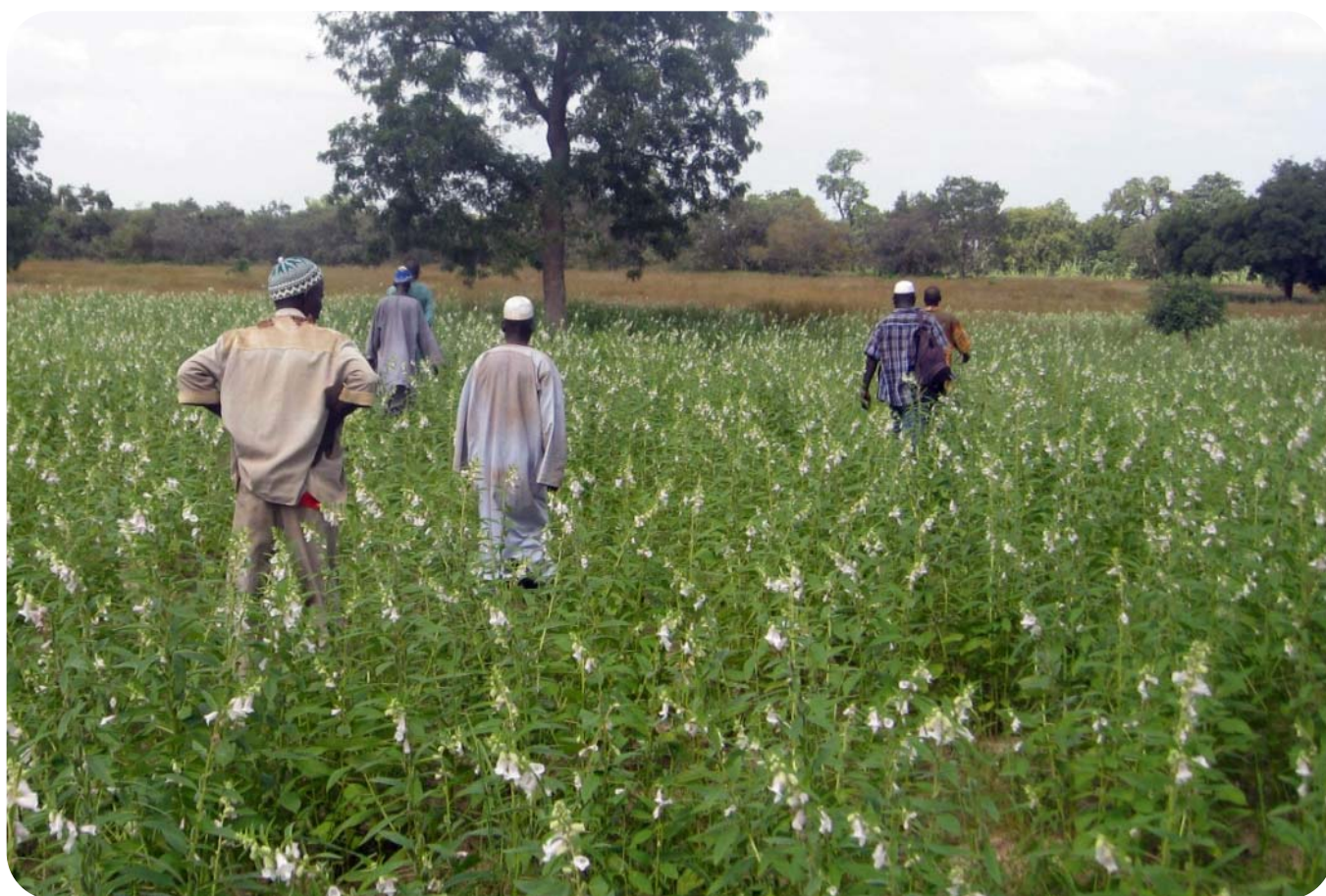
Sesame field inspection by FLO Cert, Sept. 2009.

However, the two organizations did not give up on export opportunities for premium markets in Europe and decided to increase these by achieving Fairtrade standards. Since 2006, YNW cotton is also certified fair trade by FLO Cert. Experience gained with one French organic/fair trade company provided useful training in processing techniques for fonio to generate a high quality product for the French market in taste and nutritional terms. However, the added value generated was not shared equitably with the farmers and the Federation has concentrated on national markets. Despite a number of difficulties linked to both organic and Fairtrade certification schemes, the partners recognise some benefits, mainly in terms of improved social organisation.